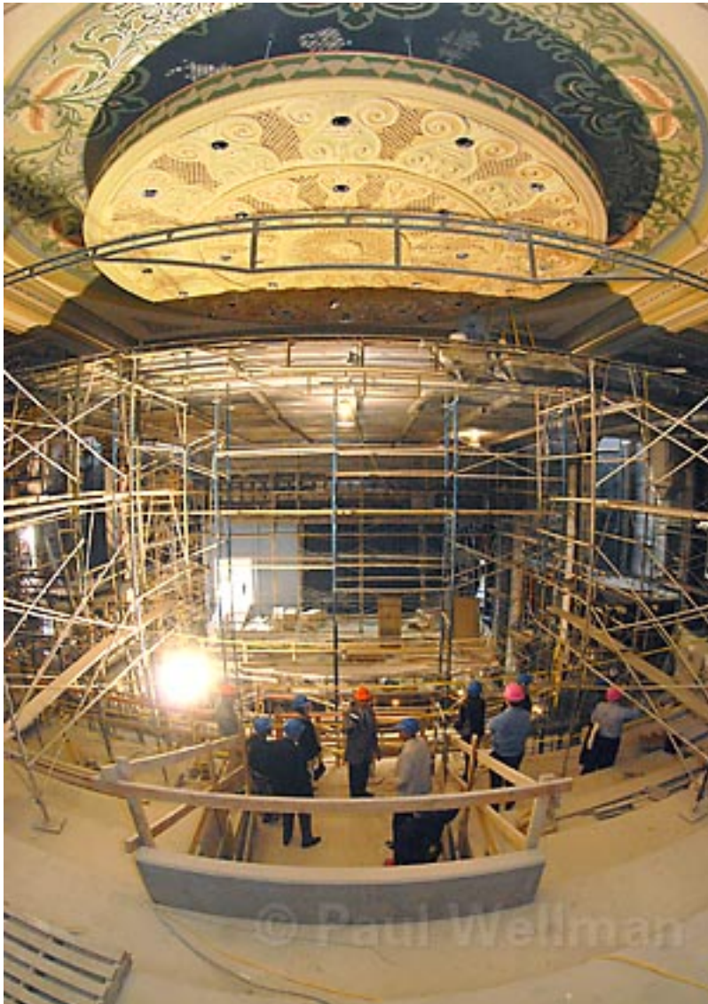
The original chandelier has been fully restored and painted.