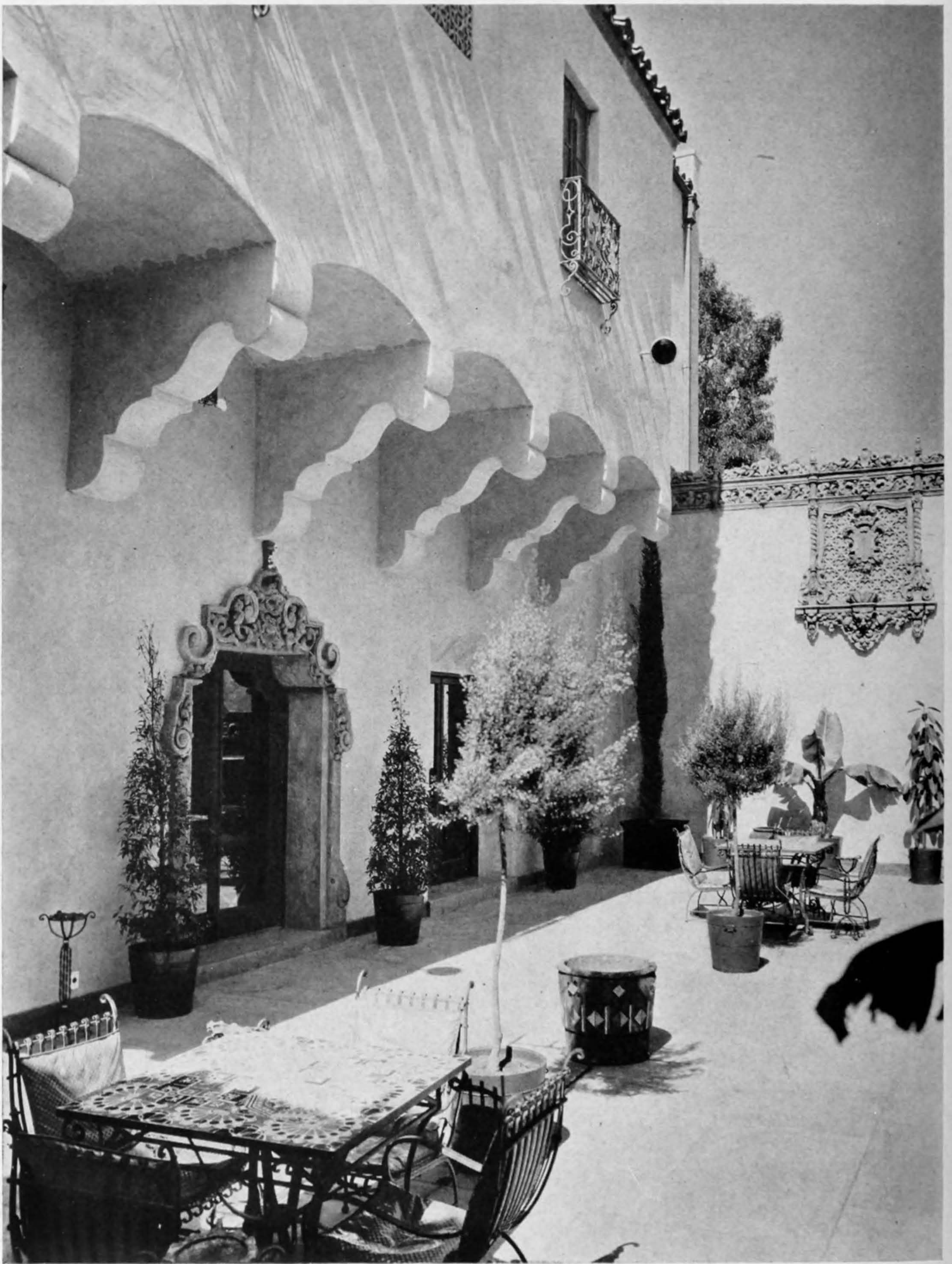
PATIO, HOLLYWOOD PLAYHOUSE, HOLLYWOOD, CALIFORNIA. MORGAN, WALLS AND CLEMENTS, ARCHITECTS