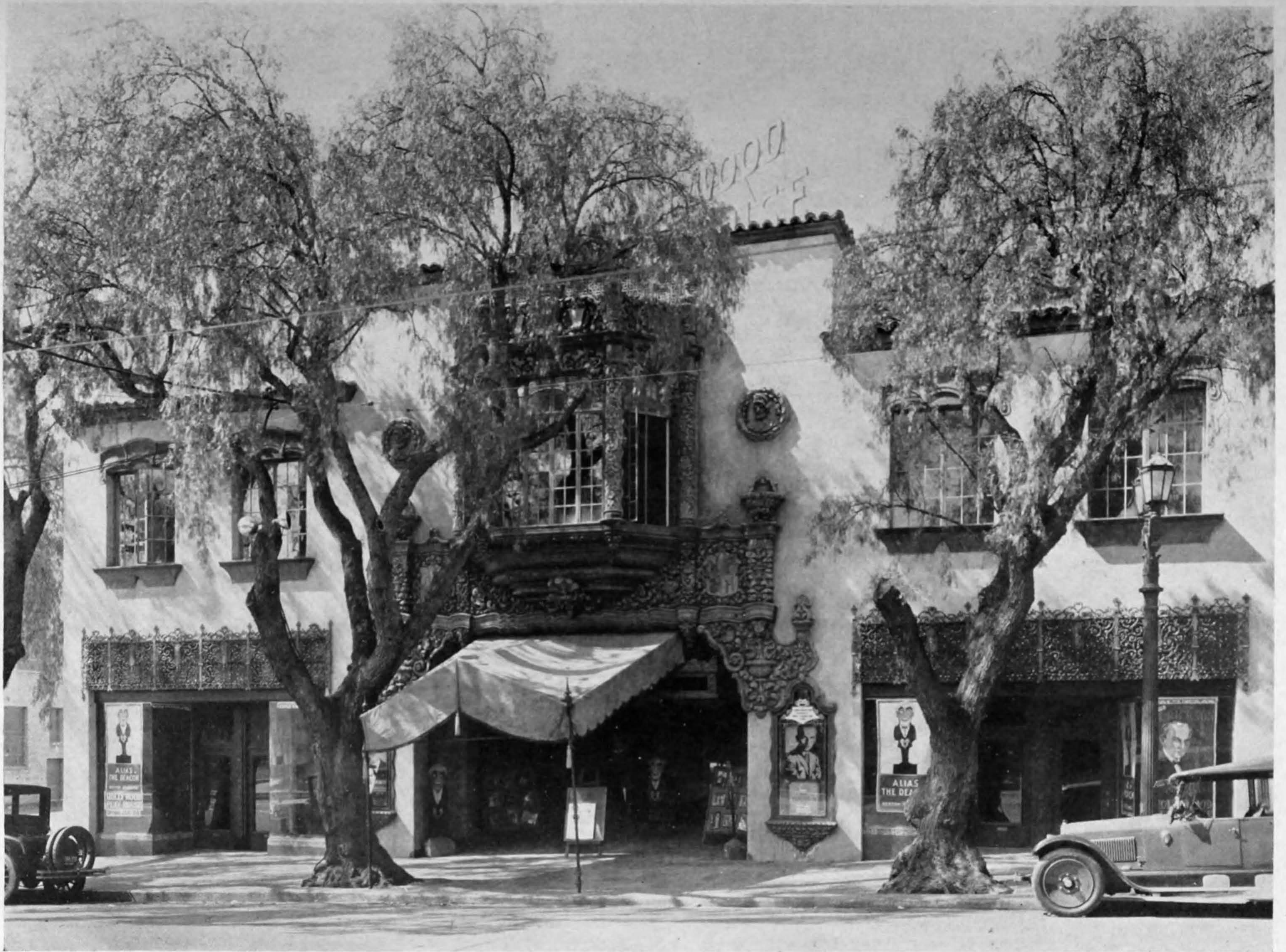
HOLLYWOOD PLAYHOUSE, HOLLYWOOD, CALIFORNIA. MORGAN, WALLS AND CLEMENTS, ARCHITECTS