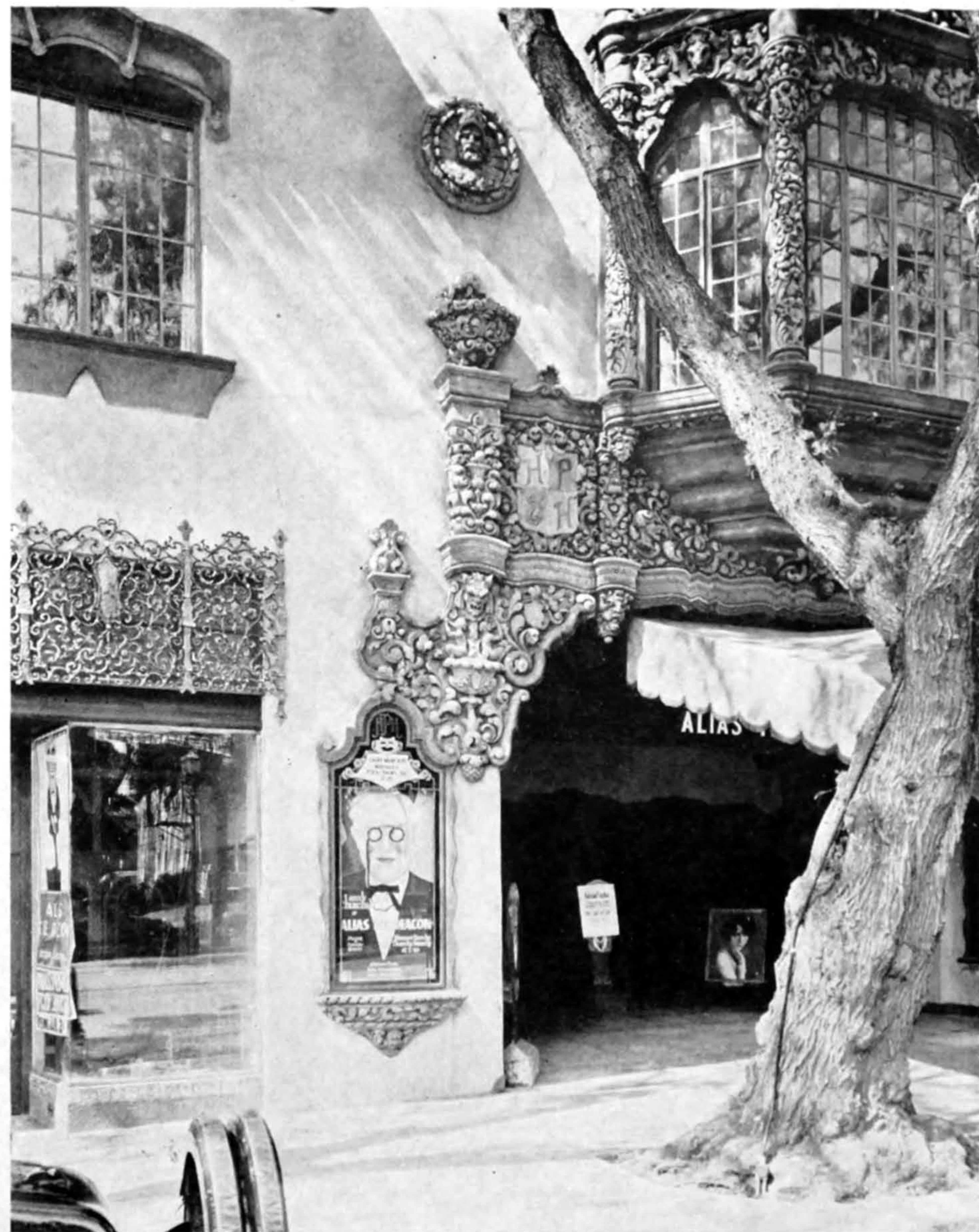
ENTRANCE DETAIL, HOLLYWOOD PLAYHOUSE, HOLLYWOOD, CALIFORNIA. MORGAN, WALLS AND CLEMENTS, ARCHITECTS