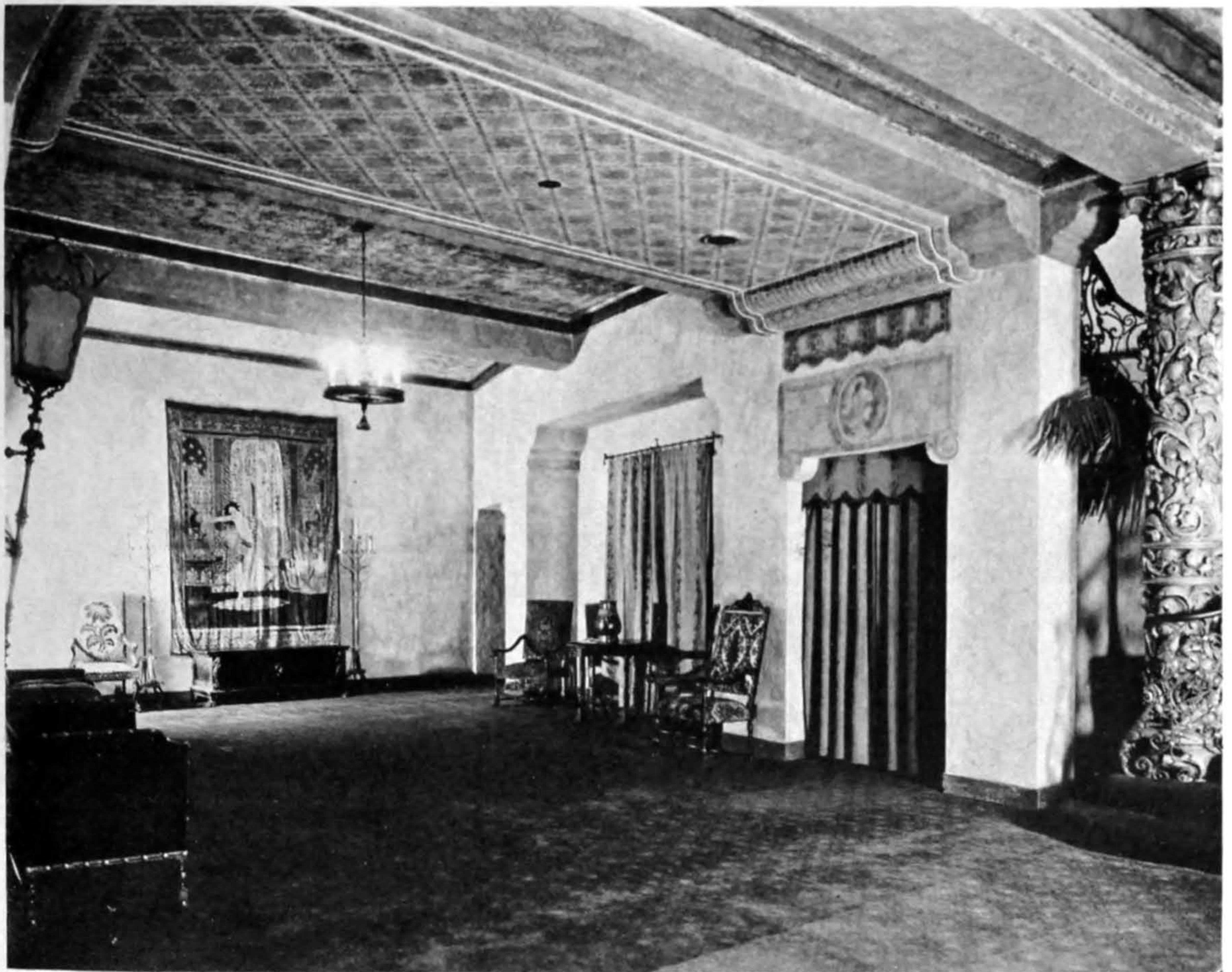
ABOVE—AUDITORIUM; BELOW—FOYER; HOLLYWOOD PLAYHOUSE, HOLLYWOOD, CALIFORNIA MORGAN, WALLS AND CLEMENTS, ARCHITECTS