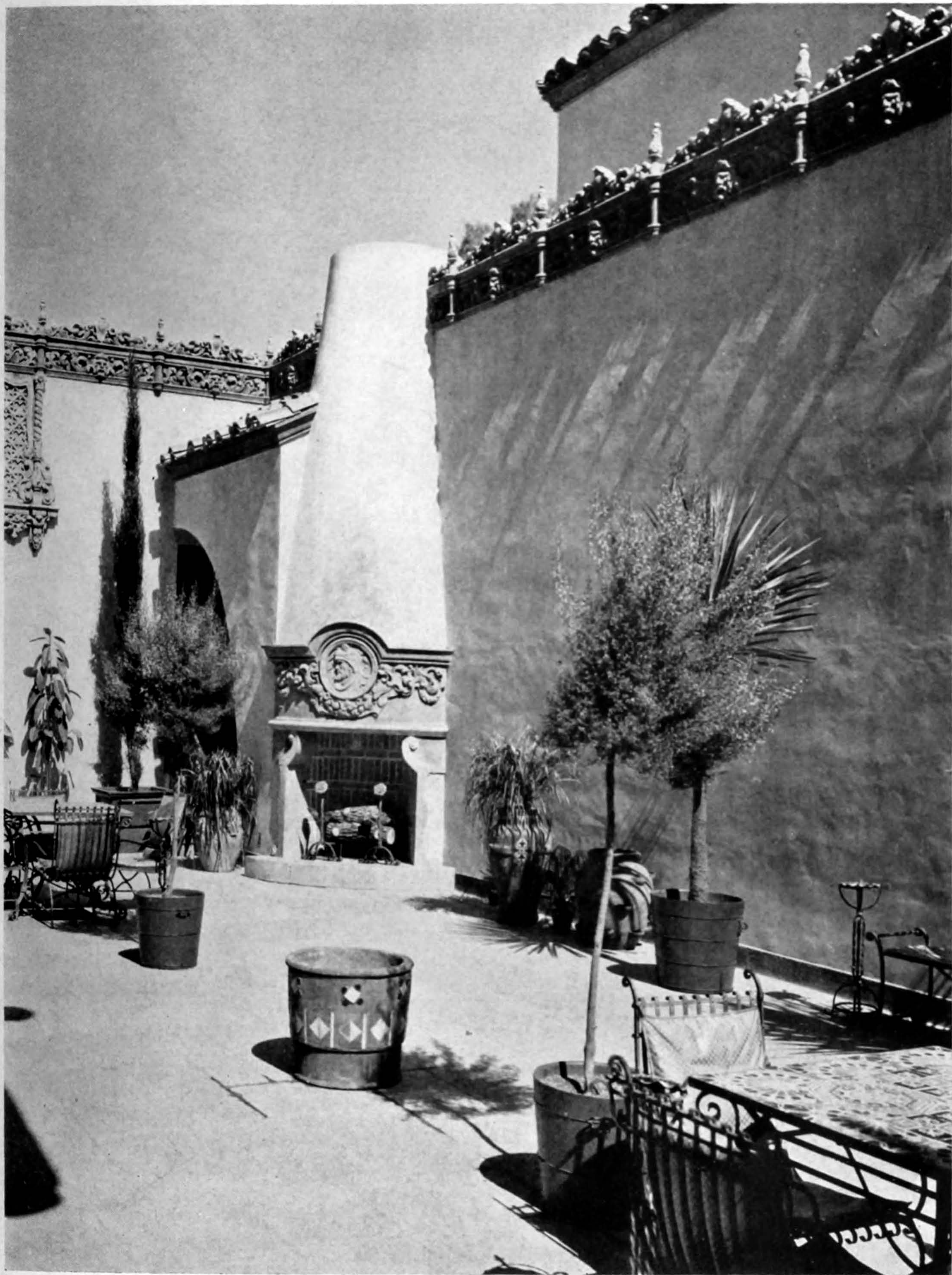
PATIO, HOLLYWOOD PLAYHOUSE, HOLLYWOOD, CALIFORNIA. MORGAN, WALLS AND CLEMENTS, ARCHITECTS