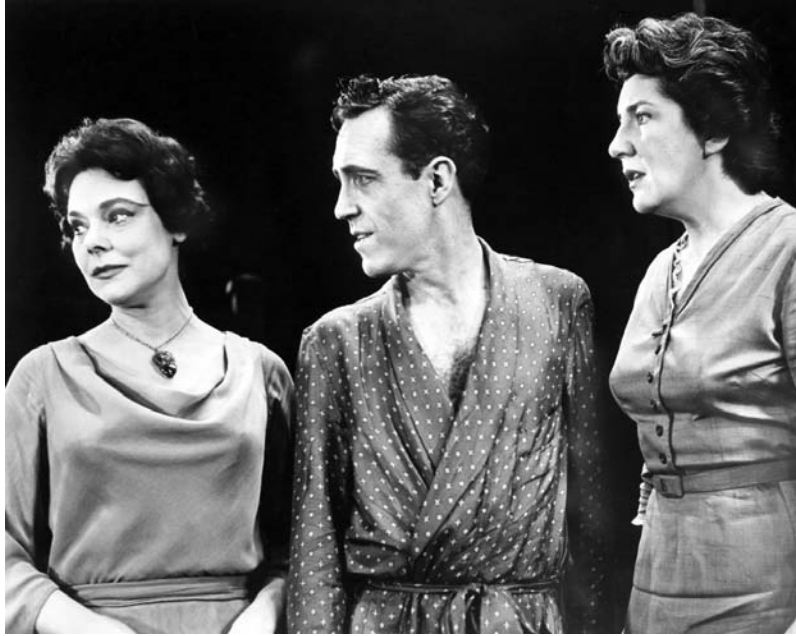
From left, Irene Worth, Jason Robards Jr. and Maureen Stapleton in Lillian Hellman's "Toys in the Attic" at the Hudson Theater in 1960.

In 1934, the theater was leased to CBS, which used it for a short time as a radio studio. It became a Shubert-managed theater for a few years, but NBC bought the space in 1950 and turned it into a television studio. One of the most famous performers to play at the Hudson when it was a TV studio was Elvis Presley, far right, shown here with Steve Allen and Imogene Coca in 1956.