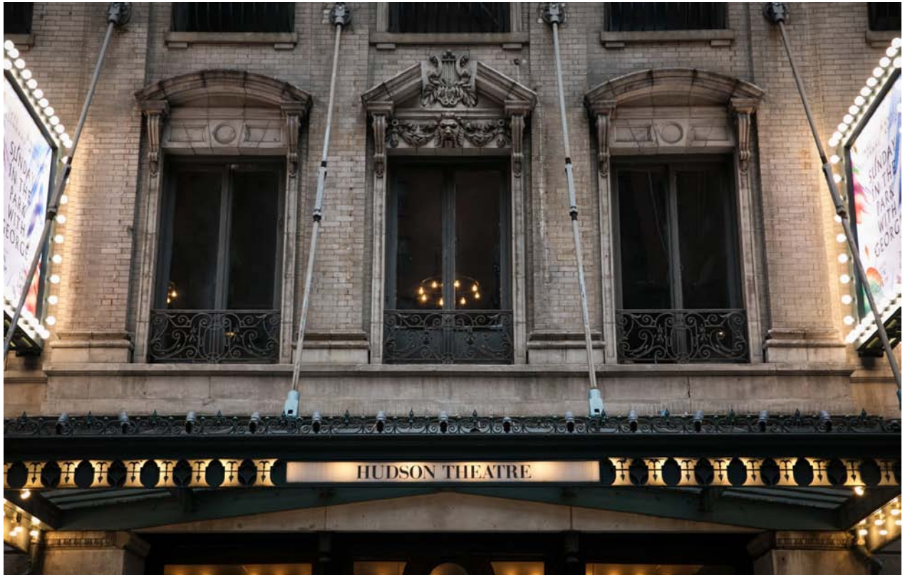
The exterior of the Hudson Theater on 44th Street.

One of Broadway's oldest surviving theaters is now its youngest.