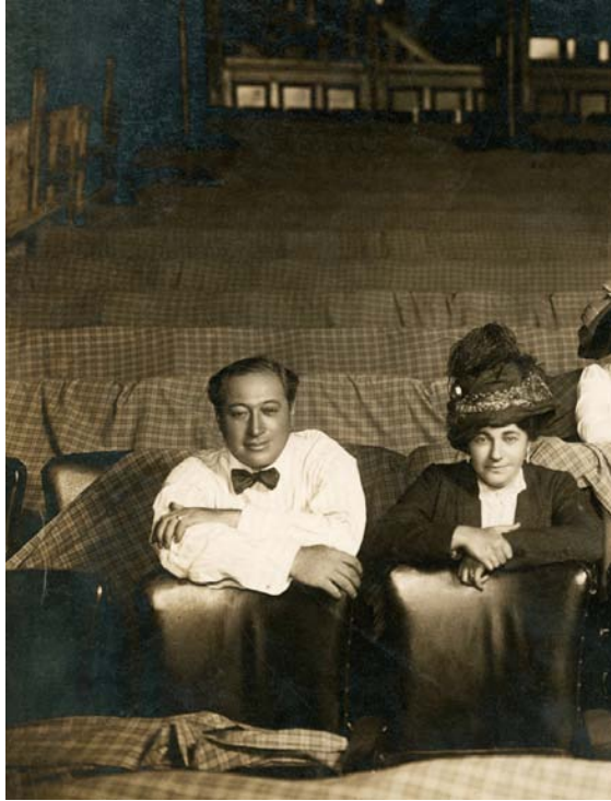
Wisconsin Historical Society