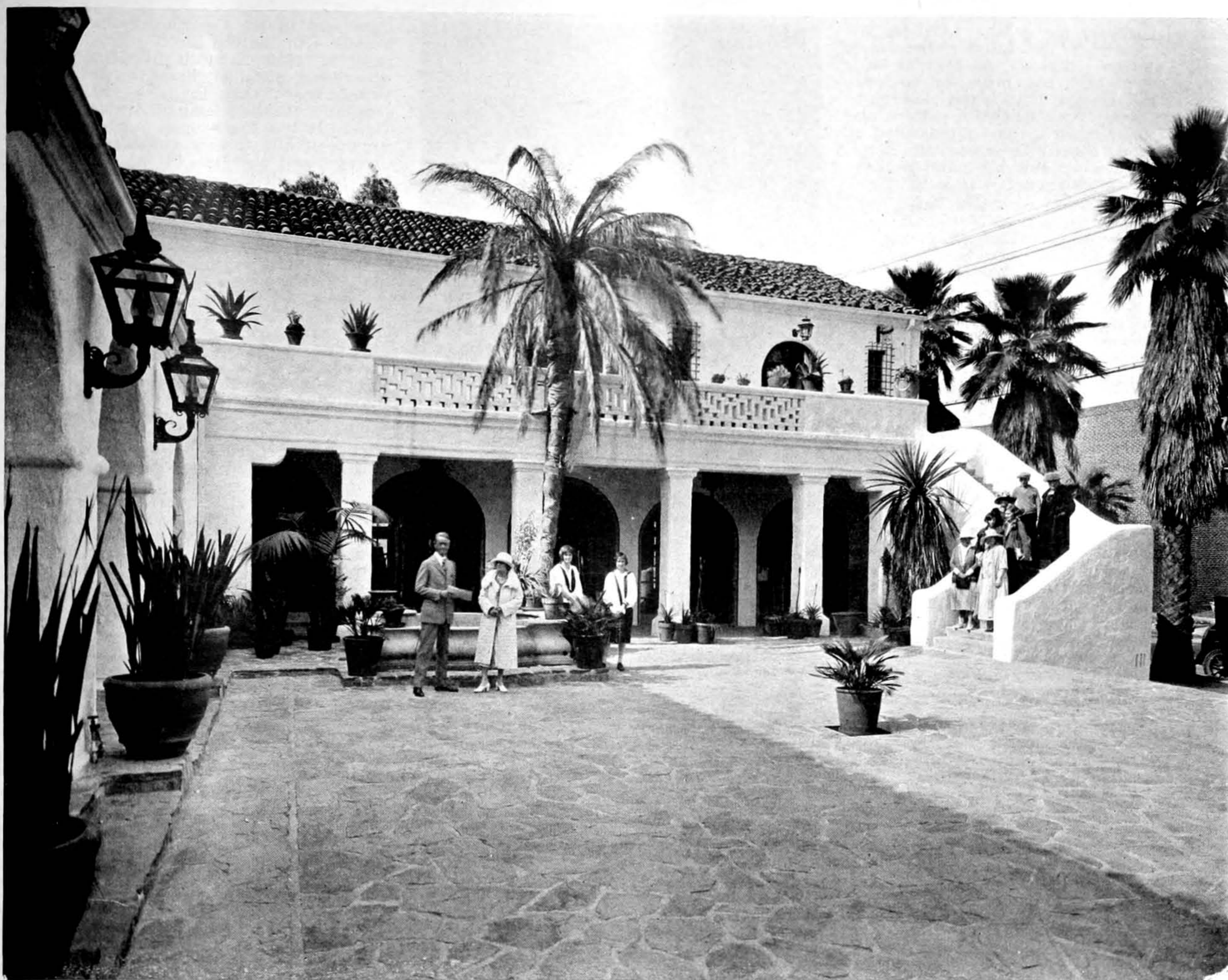
A VIEW OF THE PASADENA COMMUNITY PLAYHOUSE. WINTER CONSTRUCTION COMPANY GENERAL CONTRACTORS, 2404 WEST SEVENTH STREET, LOS ANGELES. TWO OF THE MANY HANDSOME WROUGHT IRON LANTERNS DESIGNED ESPECIALLY FOR THIS THEATRE BY ROBERTS MANUFACTURING COMPANY, 827 SOUTH HILL STREET, LOS ANGELES. THE ANCIANO STONE COMPANY FURNISHED THE BEAUTIFUL FLAGSTONES OF THE PATIO.

but we put on record here some of the main contributions as examples of the thoroughness with which the work was done. For this is an advertisement for them.