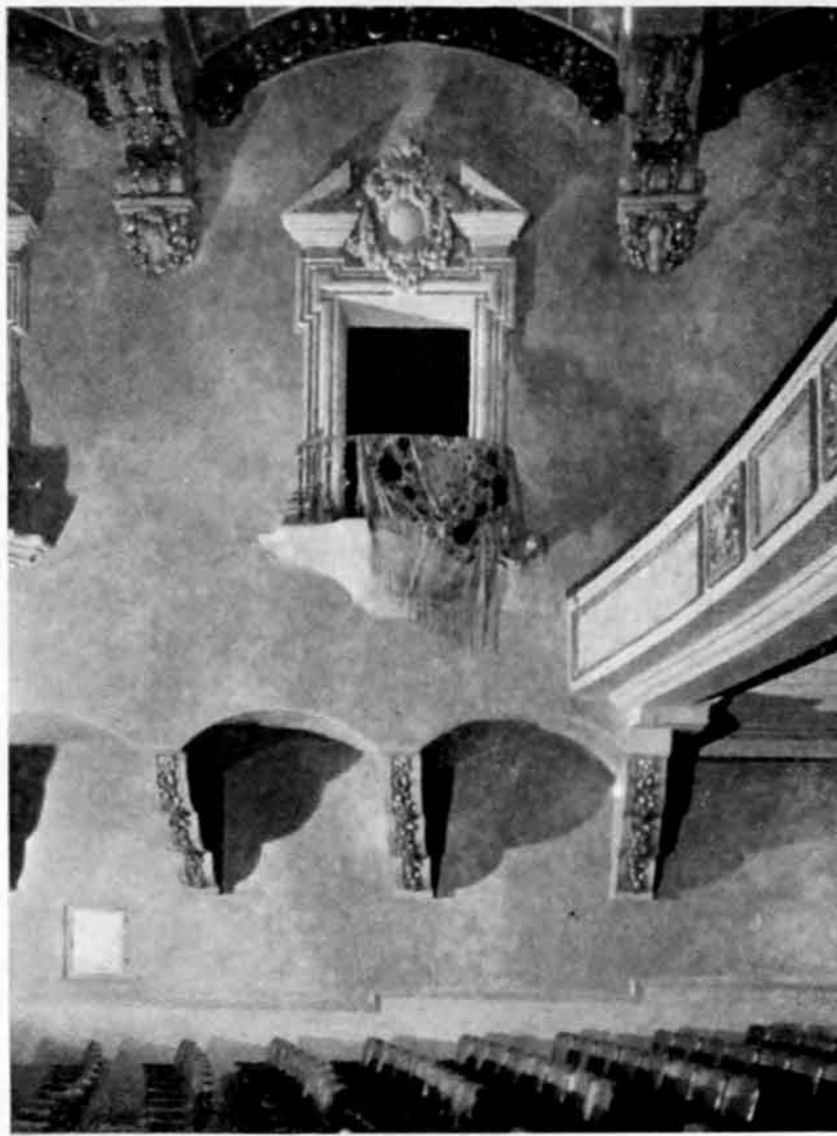
STAFF ORNAMENTS, WATKINS PLASTER CO.

The determination on the part of the Building Committee to have the most complete stage lighting equipment obtainable brought to