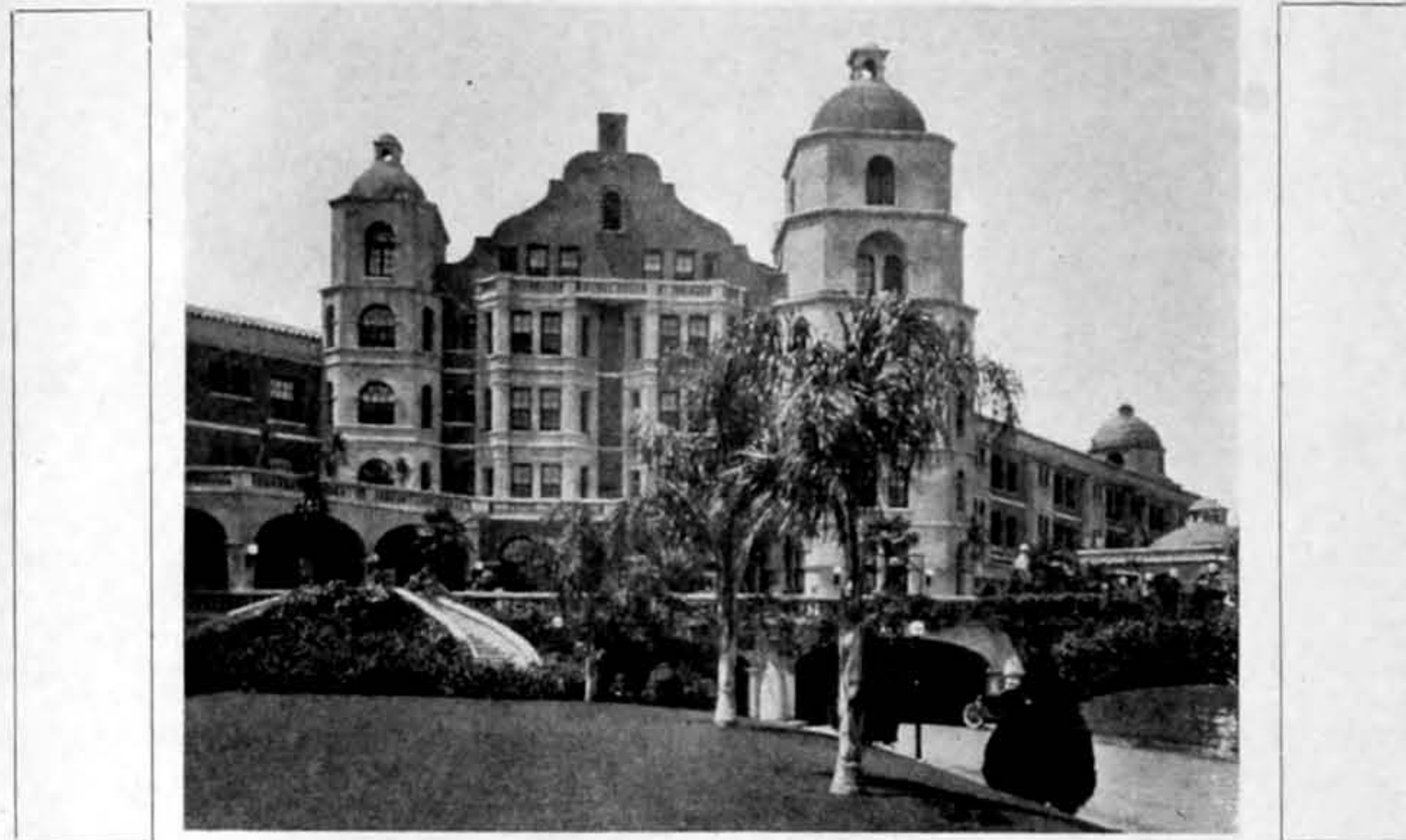
ARLINGTON HOTEL, SANTA BARBARA, WHERE MANY OF THE "UP THE VALLEY AND DOWN THE COAST" TRAVELLERS STOP.

I N the field of sports, clothes play an important part for women. For those who are most skillful demand the most comfortable and efficient garb; and this in turn, if properly made, is usually the smartest, for it will invariably be simple in line, whether golf skirts, riding coats, or bathing suits. Just as one feels sure that the girl wearing a bathing hat with a brim, is no swimmer, equally convinced is one that a woman in baggy breeches, a belted coat, or boots with high heels, can not ride. In giving advice about riding clothes, I am tempted to make a list of "nevers," and I shall head it with never follow the information given in the ordinary advertisements. "Chic" and "all the rage" never apply to riding clothes. There are no sudden changes in fashion, or new fads, but plain and sensible conventions, adhered to very strictly, by those who ride the best, because these conventions are based on comfort and upon those lines which please the eye.