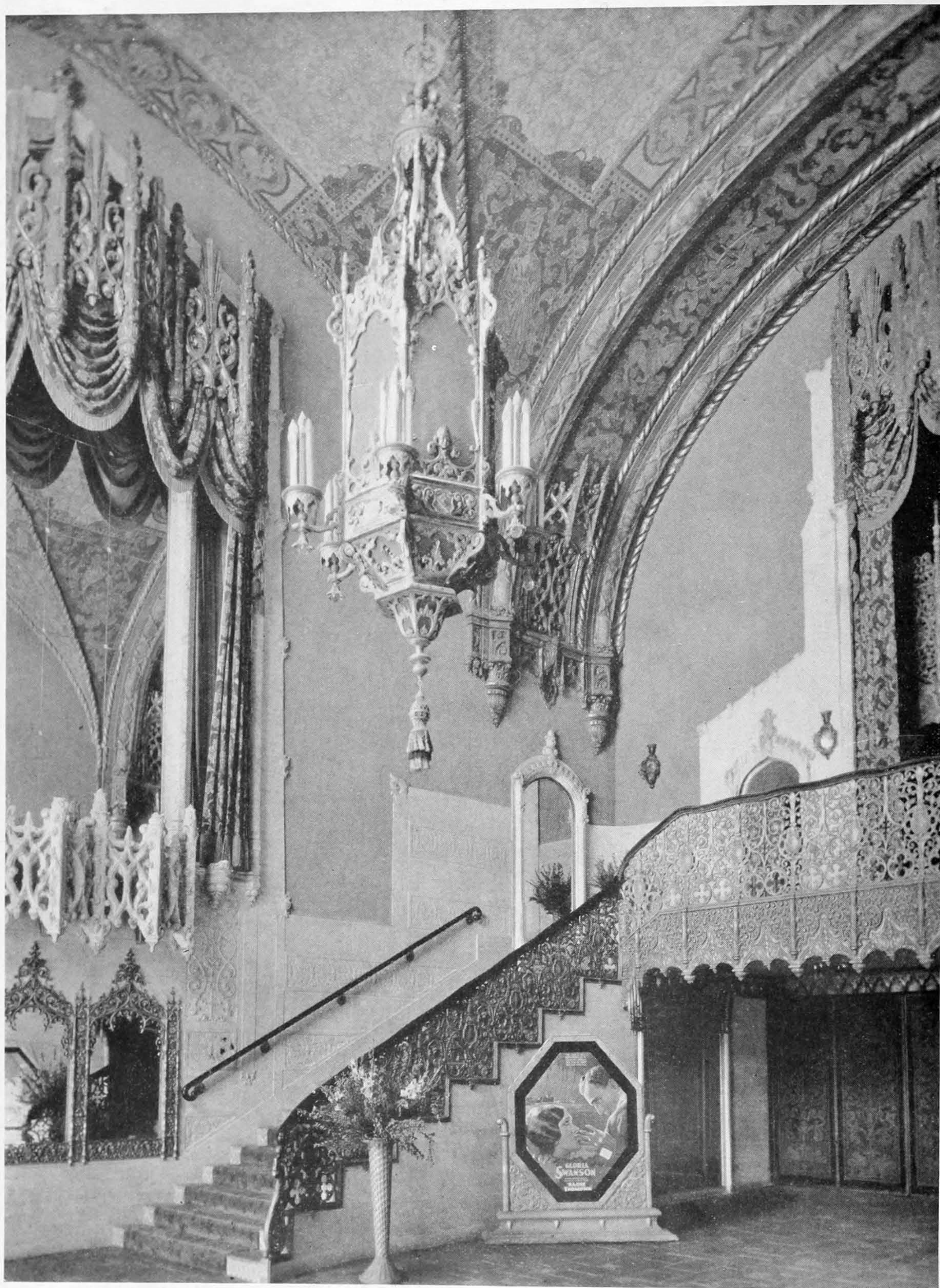
LOBBY, UNITED ARTISTS THEATER, LOS ANGELES, CALIFORNIA. WALKER AND EISEN AND C. HOWARD CRANE, ARCHITECTS.