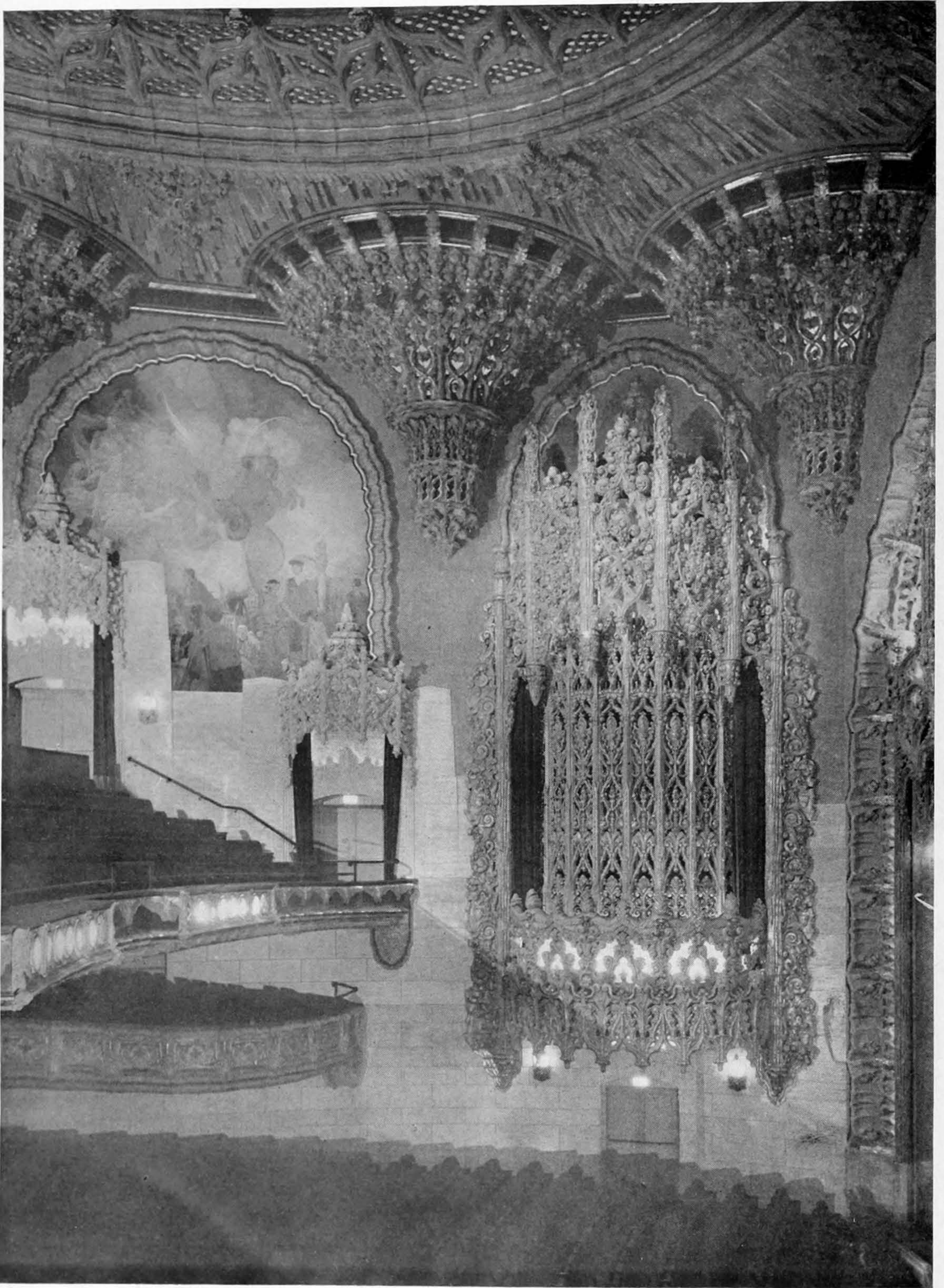
ORGAN SCREEN, UNITED ARTISTS THEATER, LOS ANGELES, CALIFORNIA. WALKER AND EISEN AND C. HOWARD CRANE, ARCHITECTS.