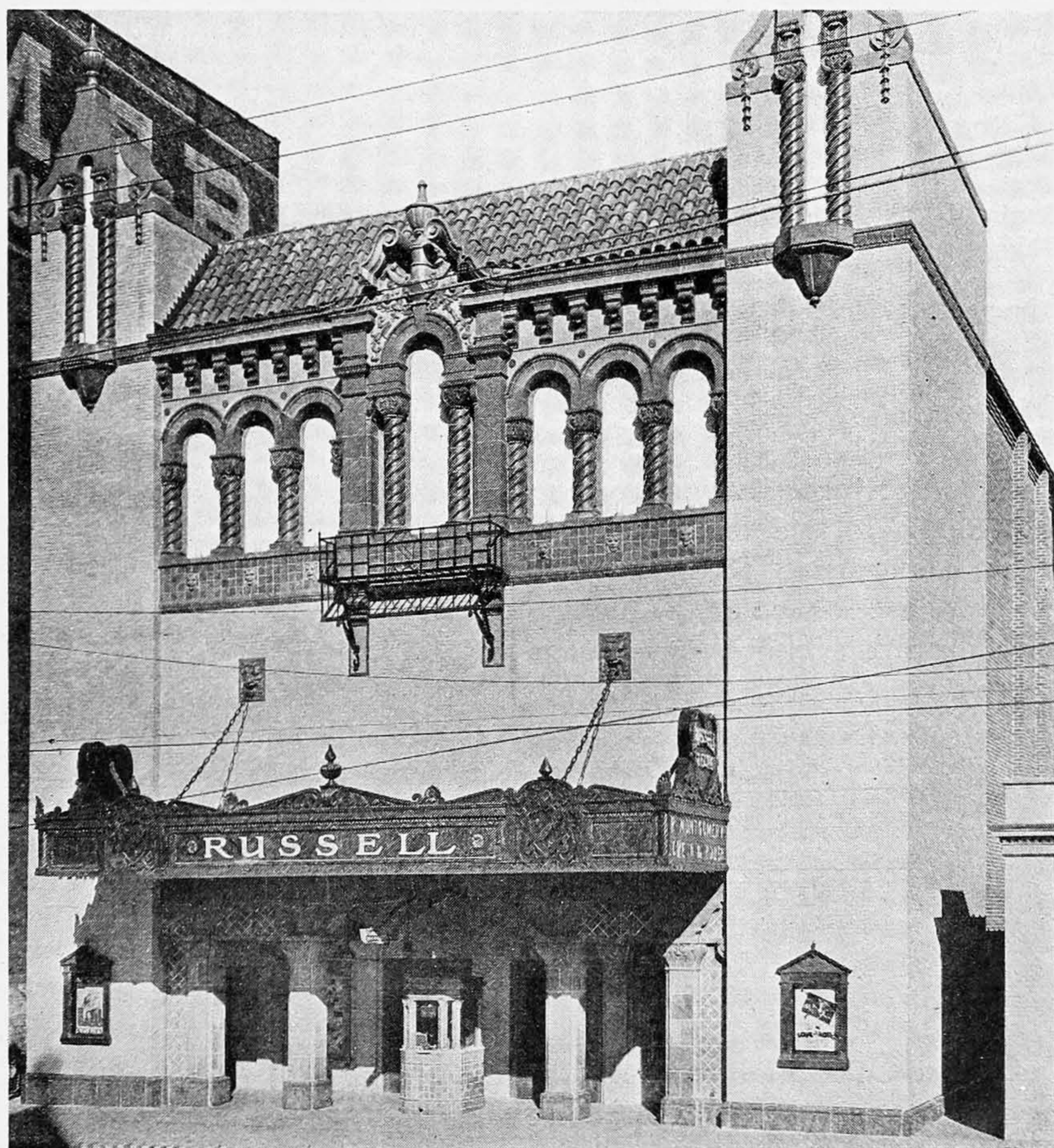
General view of the exterior and facade. The building is faced with polychrome terra cotta and three shades of buff-colored brick. Flood lighting and lighting effects are provided for.