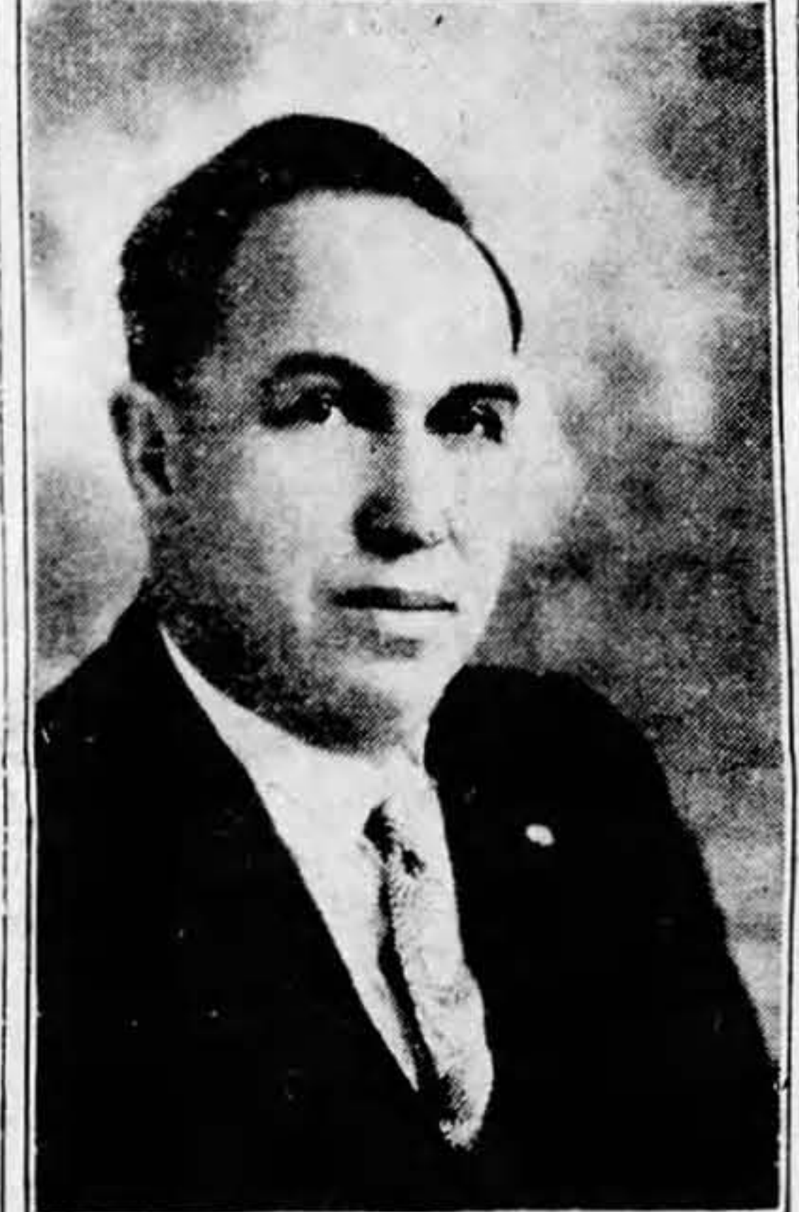
A. J. Eschelbach, president of the Bay Shore Theatre corporation and former mayor of the city will be host tonight at what should be a full house.