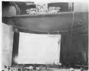
Huge 75-foot single sheet Dimension 150 screen is laced into place two days ahead of schedule as one of last steps in updating Hollywood's landmark UA Egyptian Theatre.

Major changes involved moving the projection booth down to the main floor and situating a new 75-foot-wide deeply curved D-150 screen 30 feet further back than the original screen, so as to accommodate the Dimension 150 projection system. By lowering the projection room to floor level, the projection angle was made "nearly ideal"