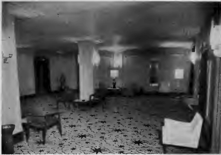
Beige and light rose formed the color scheme for the ladies' lounge, with those colors being carried out in the ground color and star design of the carpeting. Furnishings are of graceful modern design. The unusually attractive wall lighting fixtures are supplemented by handsome table lamps, and mirrors decorate the lounge walls. The adjoining restroom was also updated.