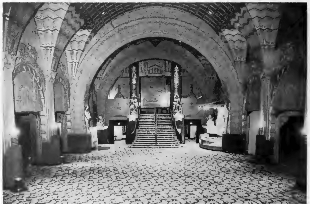
Walls and ceiling in the grand foyer were completely redecorated, and a modernized candy stand built. Highlight of the spacious area is the colorful, flowered broadloom carpet which is flooded with warm downlighting to enhance the beauty of the colors.

On the sidewalls, framing a display case on one side and the boxoffice on the other, are glass-cloth curtain panels with rear illumination. Display cases and the boxoffice are in white metal, contrasting with