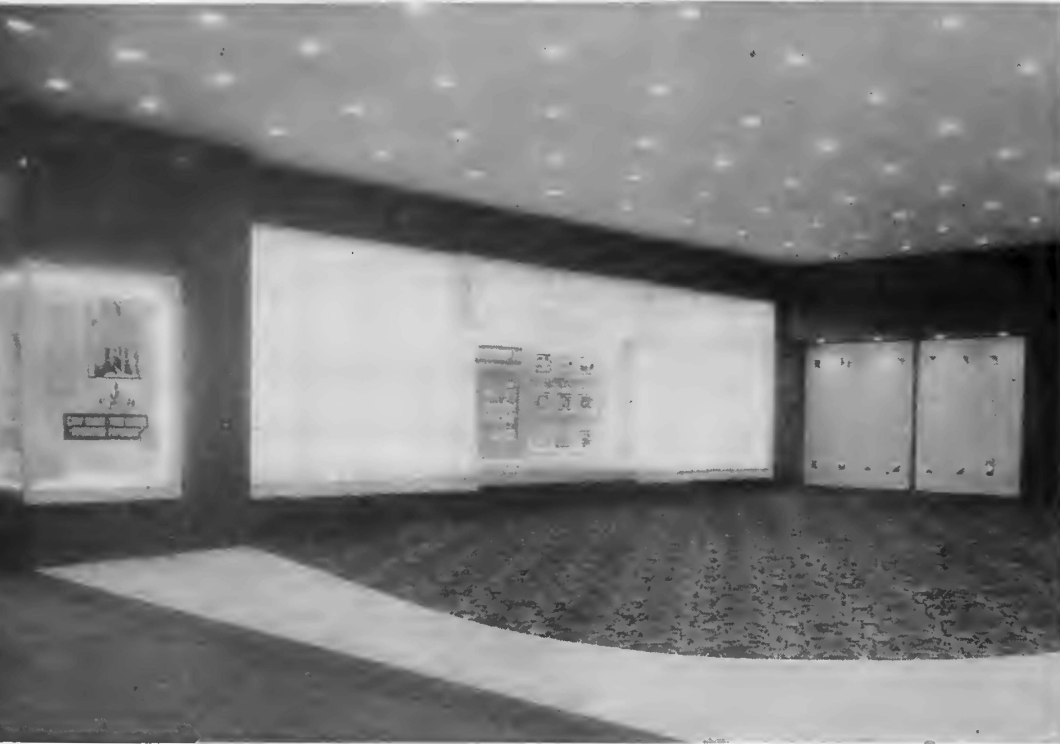
Indoor luxury extends outdoors at the RKO Pantages Theatre, Los Angeles, Calif., through the use of a combination of carpeting with terrazzo, and the glass-cloth curtain panels used on both sides of the outer lobby walls. In this photo they frame display cases; on the other side of the lobby they frame the boxoffice. Walls are off-black mosaic tile and the doors are off-white Formica.

RKO Theatres Invests $100,000 to Update Its Los Angeles Showcase, The Pantages