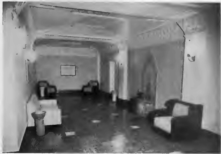
Light and warm tones were combined in the resilient floor covering and the leather-covered chairs in the men's lounge which is very definitely designed to appeal to the masculine taste. Note the attractive setting for the drinking fountain to be seen at the center right, otherwise simplicity of the walls.

leather-covered chairs combine light and dark tones.