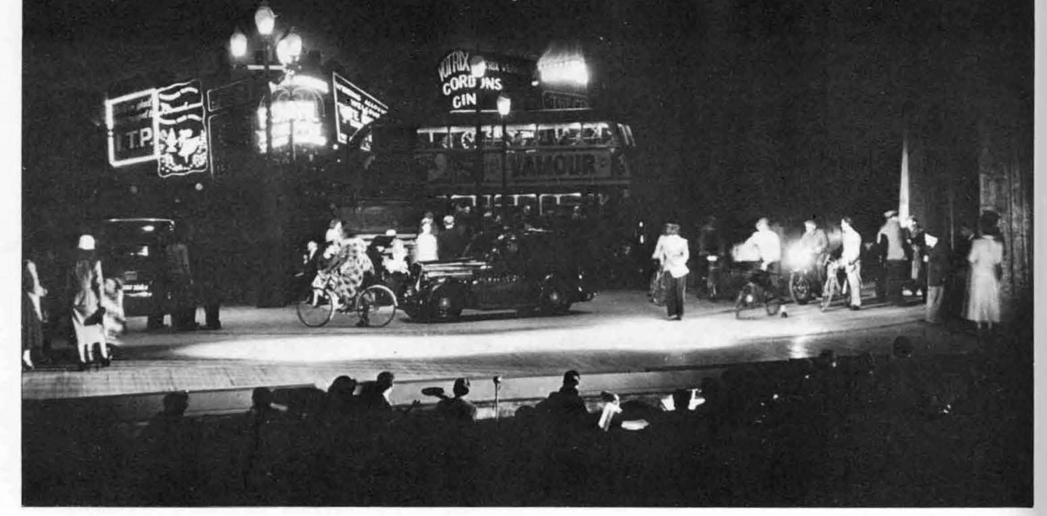
Cavalcade-Drury Lane 1931.

circuit instead of the usual practice of a common return." A revealing glimpse of early wiring practice.