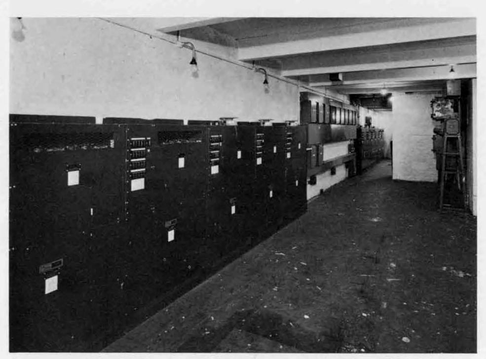
Dimmer room showing STM racks and the vast space vacated by the electro-mechanical banks.

MMS System, before that felicity was attained. Back in 1950 the most that was promised was that it would occupy the old switchboard room on the P side of the stage and a small observation window would be contrived in the wall between it and the auditorium. Even this was out of reach on that distant Monday because nothing could be done until the old boards (all three) could be stripped out and the builders take over. So it was that Paul Weston as the operator was seated in the P side scene dock with his back to the stage, which in any case was completely masked-off with curtains. Only one cue was visible and then only as some reflected light high up on the brick wall.